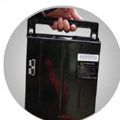
Portable Lithium Battery