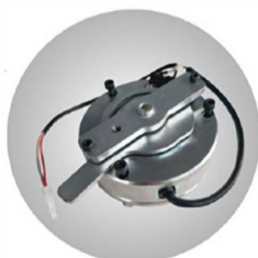
Manual Break Release